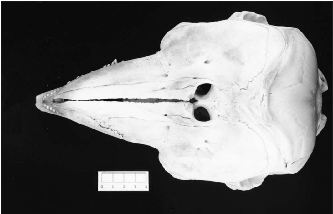
Figure 5 Phocoena phocoena NMR 9990-00168, skull, dorsal view. (scale bar = 4 cm)

Neonate, sex unknown. Complete mummified head. Occipital, left temporal, basioccipital and one tympano-periotic detached. Sex unknown. No measurements taken.