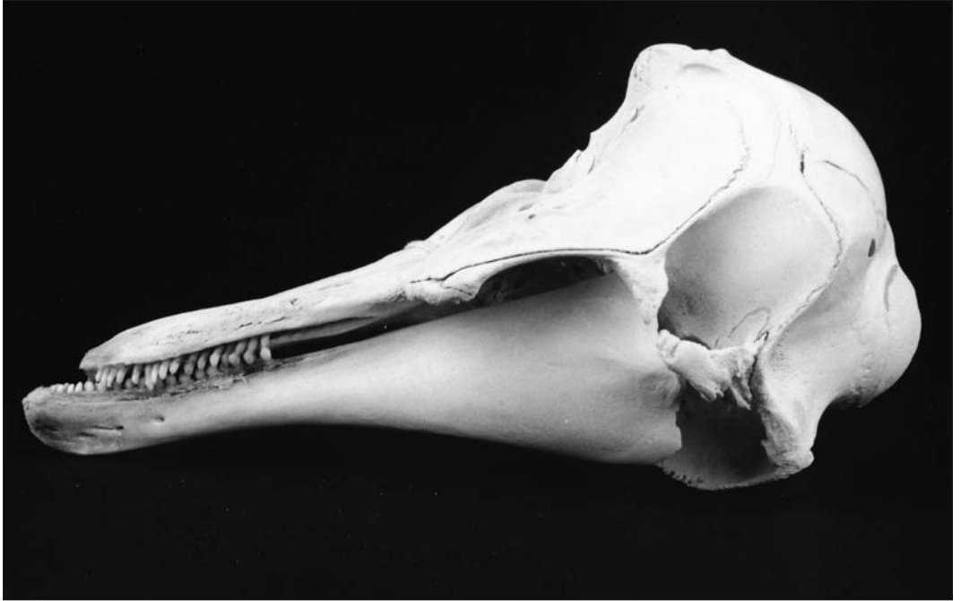
Figure 6 Phocoena phocoena NMR 9990-00168, skull, lateral view.