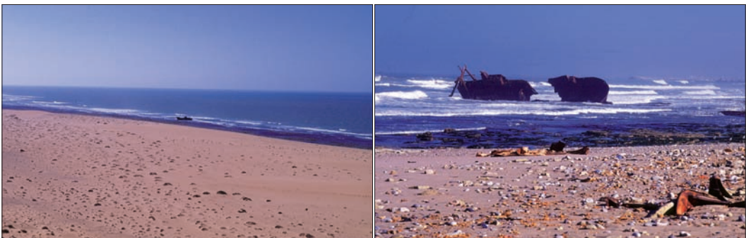
Figure 1 The beach of Tan Tan, Morocco. [photo's M.C.J. van Leeuwen]

NMR 9990-00167 Collected in February 1995, on the beach near Nouakchott, Mauretania.