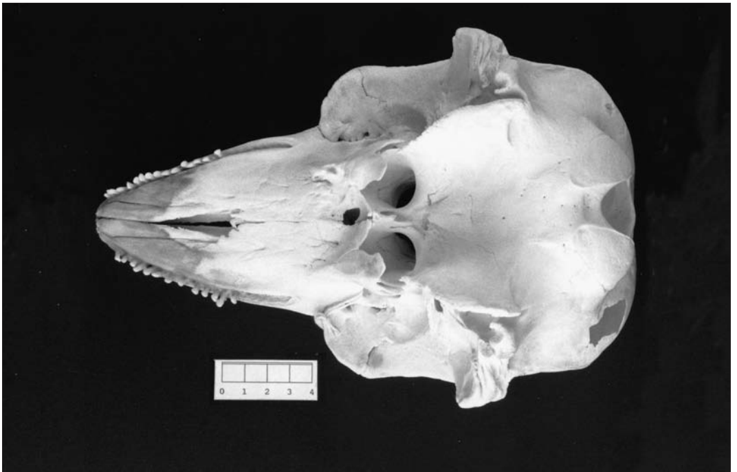
Figure 7 Phocoena phocoena NMR 9990-00168, skull, ventral view. (scale bar = 4 cm)