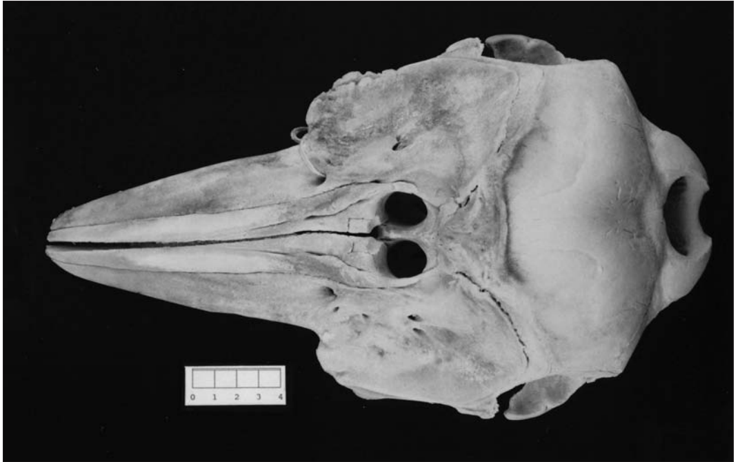
Figure 2 Phocoena phocoena NMR 9990-00167, skull, dorsal view. (scale bar = 4 cm)